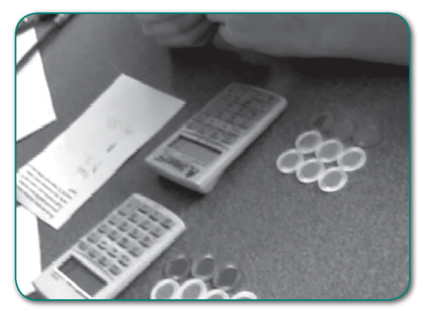
Figure 1. Dougal using counters and calculators to solve the problem Brush Up.

to see the problem clearly and they developed their mathematical argument in a strategic and organised manner.