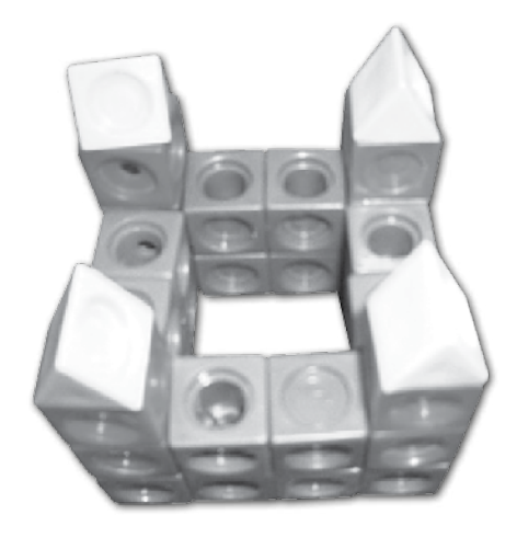
Figure 3. Evan's model of a house with corners built top to bottom as blue, red, red green.

symmetrical pattern. He said that his house "is shaped like a cube", recognising the approximately equal-sized length, width and height, if the "chimney/turret" line is visualised. His drawing showed how he visualised the faces of the house by replicating the same pattern on each side (Figure 4). Evan's representation showed that he could reflect more deeply about common features of the structure, such as noticing that the walls must be congruent.