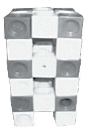
Figure 7. Dylan's model of a house (top to bottom as orange, yellow alternating cubes and yellow in the middle column).