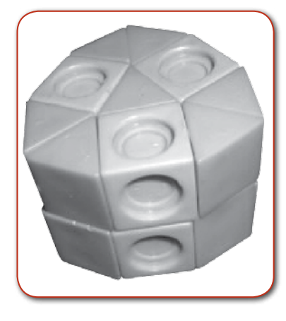
Figure 5. Andrew's model of a house.

Dylan's model, shown in Figure 7, was a rectangular prism that was hierarchically complex. He made the model by constructing four individual towers, and then connecting the towers to create a series of bridges. He showed an awareness of pattern and structure by aligning the vertical and horizontal frames on each side of the model. This demonstrated flexibility in his thinking and an ability to see relationships between the parts.