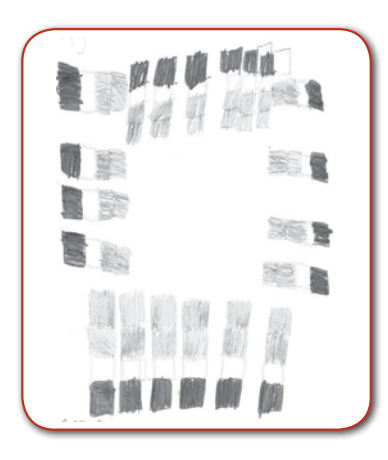
Figure 2. Grace's drawing of her model.