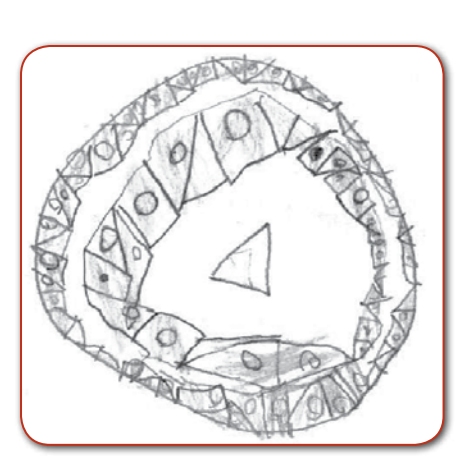
Figure 6. Andrew's drawing of his model depicting a circular pattern.