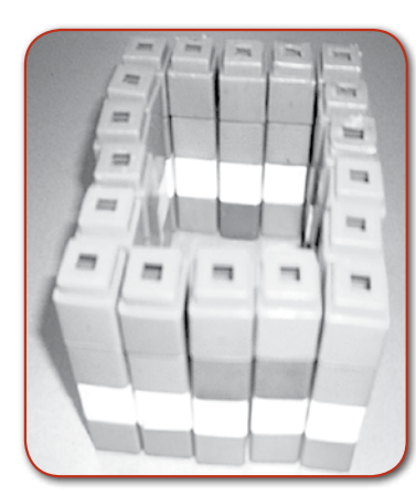
Figure 1. Grace's model using single towers from top to bottom (orange, green, white and blue).

Evan constructed four identical faces by making the model in segments ("walls"). The model also shows a